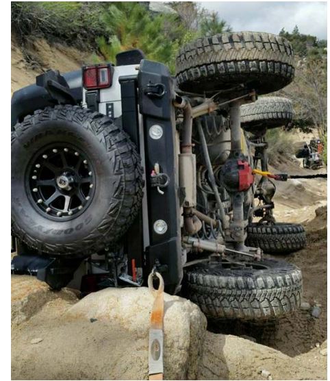
tis the season for rolling.